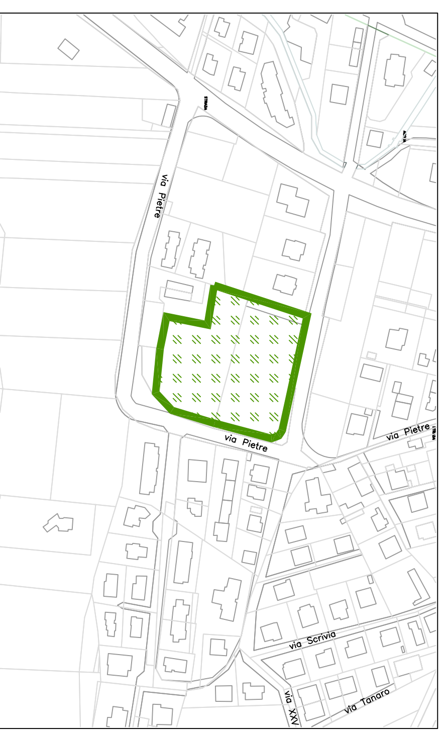
B - AREA VERDE DEL "PARCO GRANDE TORINO"